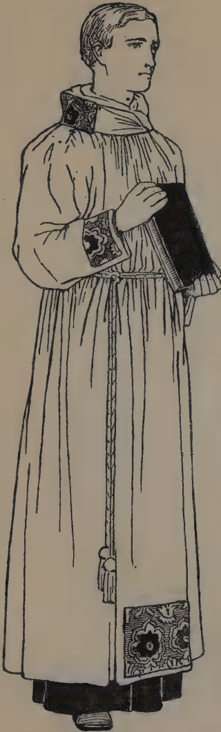
CLERK IN CASSOCK, AMICE, ALB, AND GIRDLE.